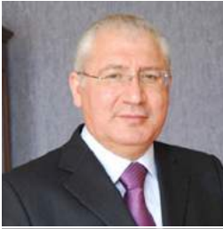
Heydar Asadov Minister of Agriculture of the Republic of Azerbaijan